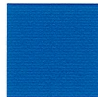
216MST Blue #808266