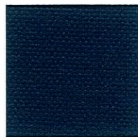
224MST Indigo #808274