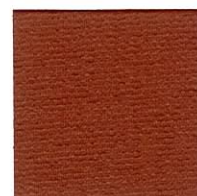
225MST Terra Cotta #808275