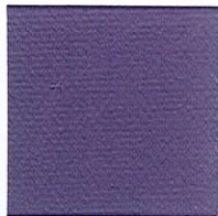
207MST Dark Lavender #808257