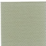
227MST Dark Linen #808277