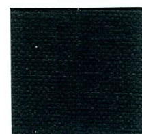
214MST Black #808264