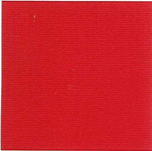
200MST Red #808250