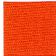
201MST Orange #808251