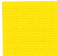
202MST Yellow #808252