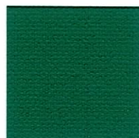
204MST Dark Green #808254