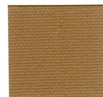
211MST Toast #808261