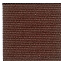
210MST Cranberry #808260