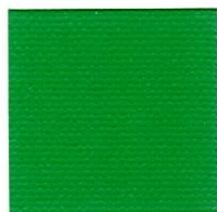
203MST Grass Green #808253