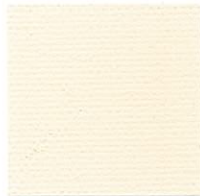
229MST Ivory #808279