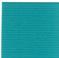
228MST Teal #808278