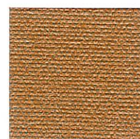
234MST Copper #808284