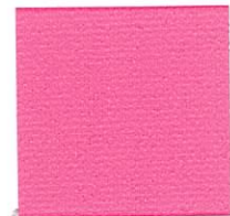
209MST Pink #808259